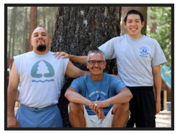
<u>3rd Session Senior Counselors</u> Commando, Dolphin, Simba