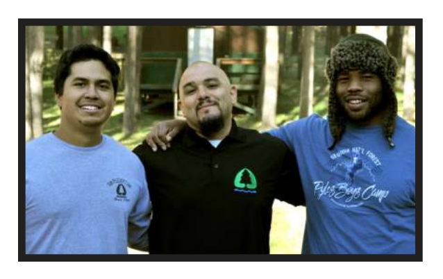
<u>1st Session Senior Counselors</u> Rambo, Commando, Sniper