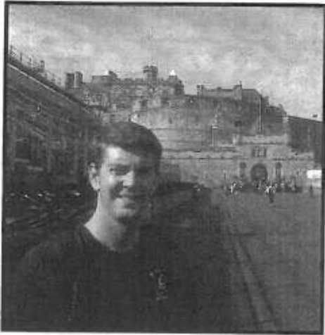
McFly in Scotland

Two roads diverged in a yellow wood, and sorry I could not travel both and be one traveler long I stood and looked down one as far as I could to where it bent in the undergrowth.